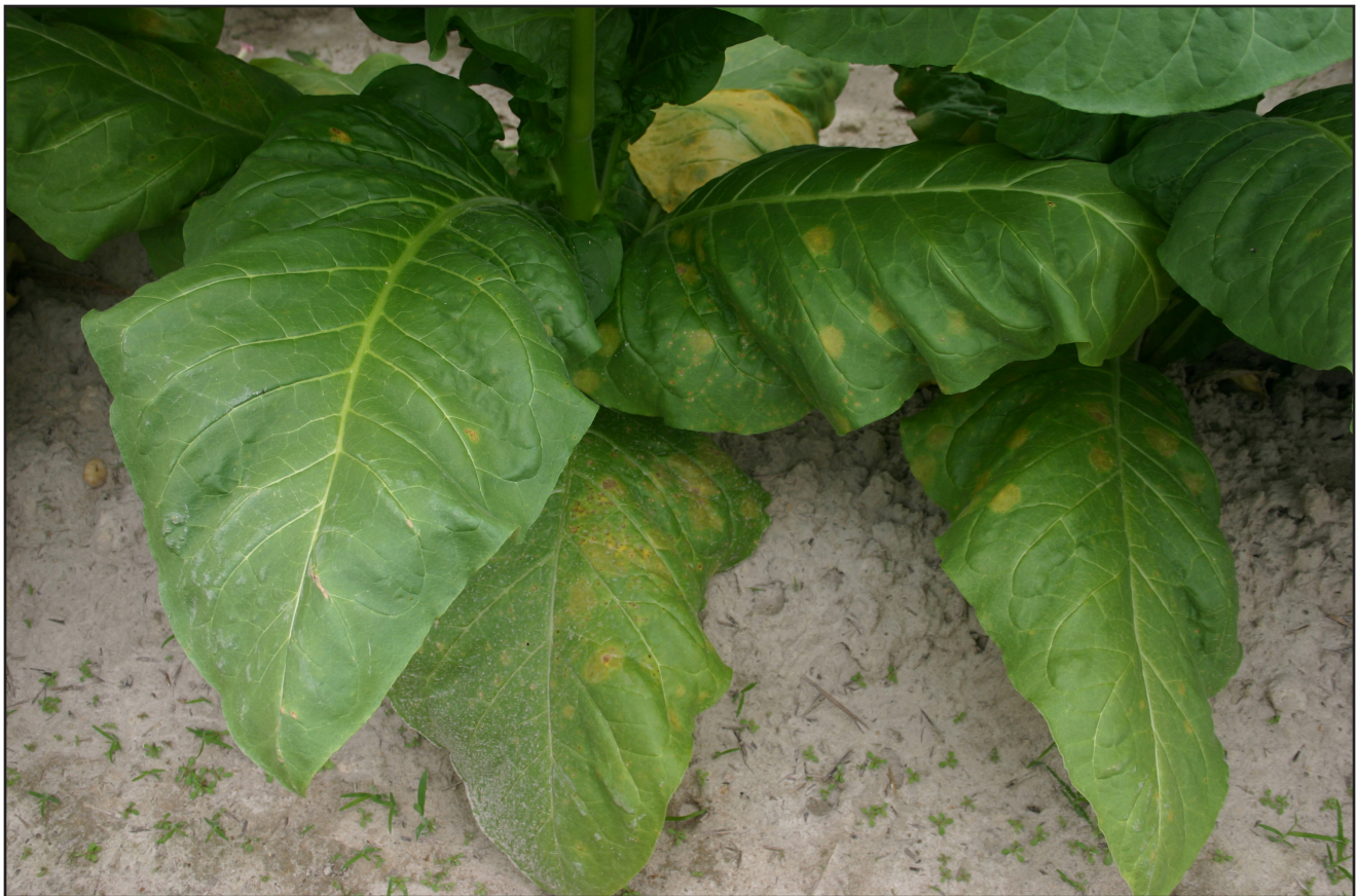
FIGURE 2. ORANGE-YELLOW LESIONS ON TOP SURFACES OF TOBACCO LEAVES IN THE FIELD.

By using alternate modes of action, growers may preserve the efficacy of fungicides as powerful disease management tools for many growing seasons to come.